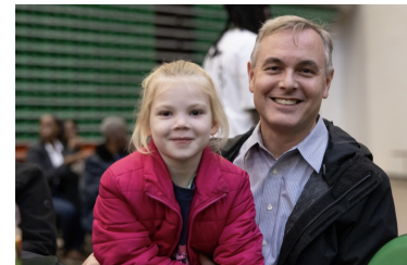
Participating in DEMP Week 2025 events, such as the anti-bullying rally and the celebrity basketball game.

Leon County Commission, District 3 | 301 S Monroe St | Tallahassee, FL 32301 US